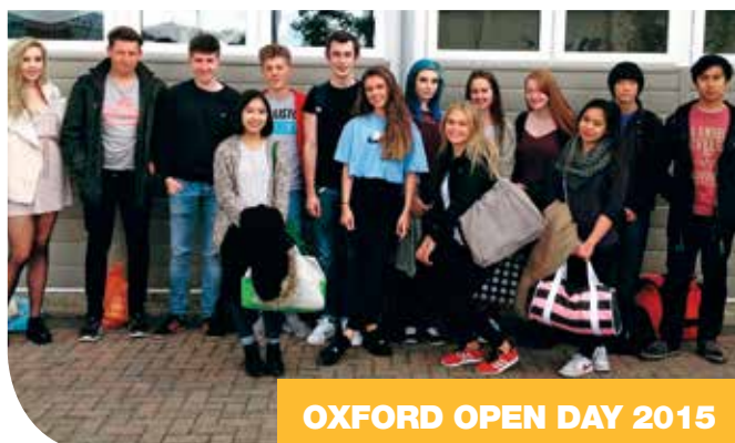
OXFORD OPEN DAY 2015